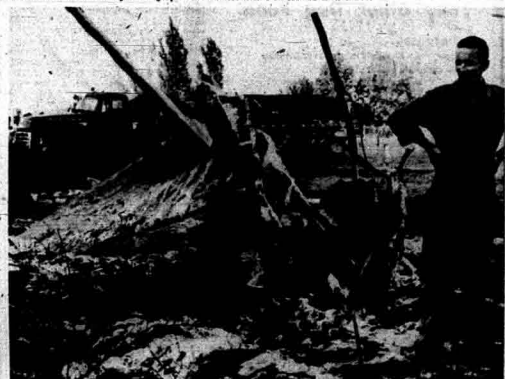
TO SAVE CLUES —An unidentified sergeant of the air National Guard stands near the wreckage of the tail section to protect it against souvenir seekers and preserve for investigators any clues to the cause of the Sunday afternoon crash.