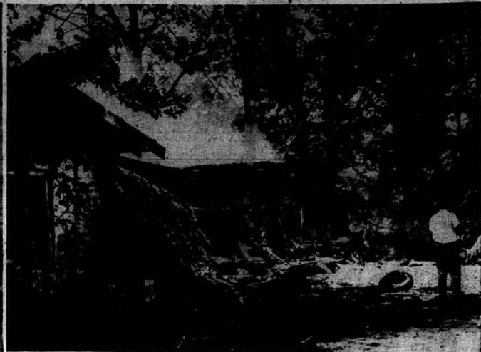
END OF FLIGHT —The wreckage of the jet plane and, in this picture of the scene after firemen had extinguished home at 4042 East Dakota Avenue seem inextricably mixed most of the blaze in house and trees.