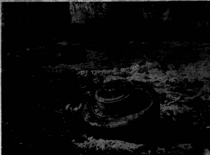
WRECKAGE —The engine from the shattered jet plane is shown here near the corner of the burning home and a wheel lies in the foreground.