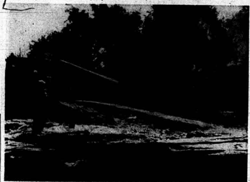
FOAM VS. FLAMES —Fireman battle with pressured foam the flames set by the explosion of the plane.

GAZA, Egypt, Sept. 12 (AP) — The Egyptian-Israeli mixed armistice commission today found Egypt guilty of an Israeli complaint a number of Egyptians infiltrated 25 miles inside Israeli territory near Beerabeh, killing one Bedouin and running away with 100 sheep August 31st.