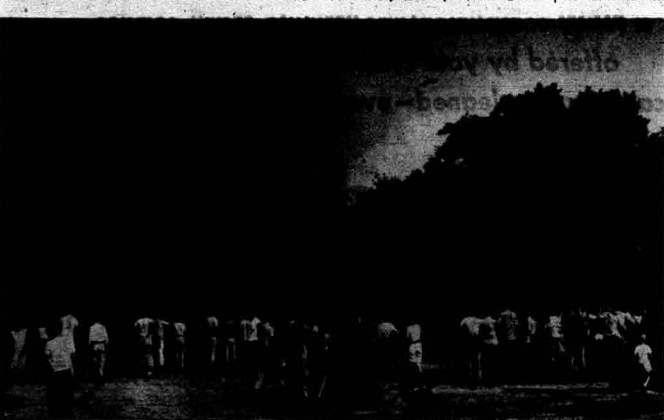
SPECTATORS —This is part of the crowd which hampered firemen in their fight against the plane caused flames. The curious disregarded exploding machine gun bullets from the plane's ammunition boxes.